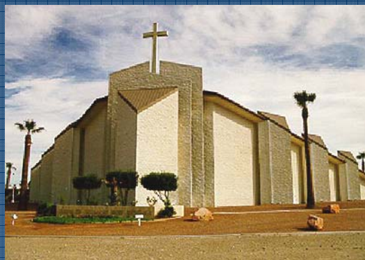
Guardian Angel Cathedral Shrine of the Most Holy Redeemer